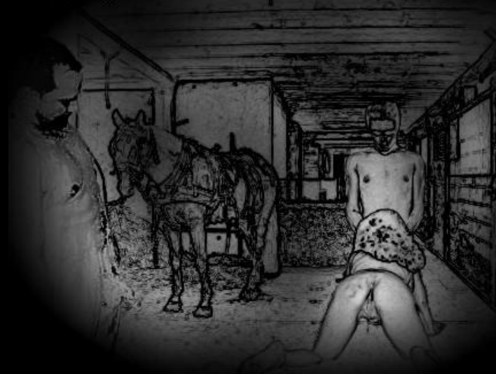
Riding the stable lads

decided it was time for her complete submission to their will. Within, the chains were adjusted, her legs being pulled back to the wall and hence her hips being twisted upwards so that her anus was displayed to best advantage. Now, a blunt object depressed the slight concavity of the rosebud dimple of that most feminine and private opening, which she had never allowed to receive the attention of any man, or indeed even to be seen other than perhaps in some unguarded moment as she rose naked, satisfied and careless, from a lover's bed. Her mother, a